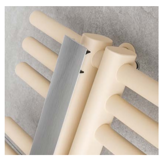
Kronos is supplied with the polished aluminum strip; you can remove it at any time and thus change the appearance of the radiator.