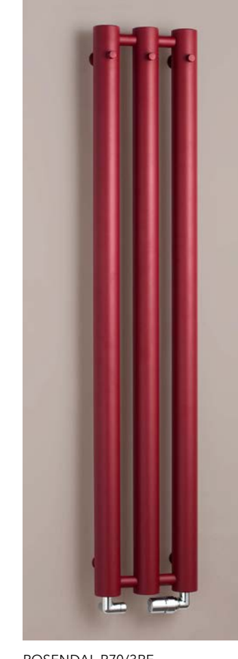
ROSENDAL R70/3RE claret coated (structural colour)